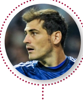
Professional footballer IKER CASILLAS Youth empowerment