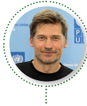
Actor NIKOLAJ COSTER-WALDAU Climate action, gender equality